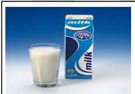
drink - milk