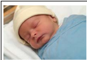
born - May